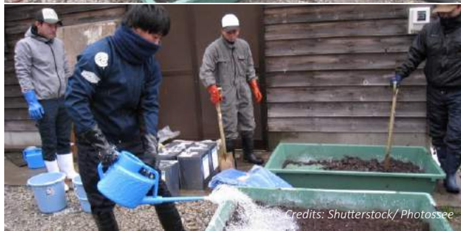
The sea urchin shells are crushed and then mixed with natural latex