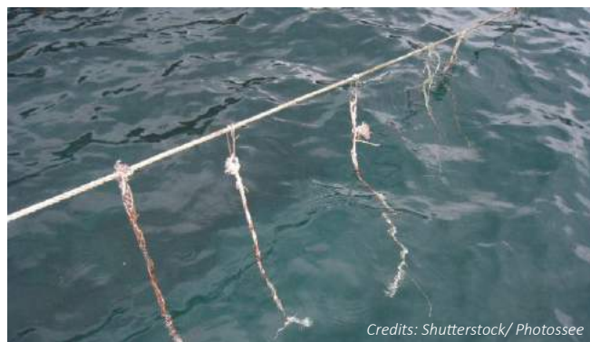
Treated ropes were lowered into the water at the test sites