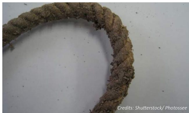
Cotton rope treated with dried sea urchin shell powder and latex