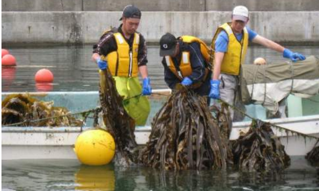
Harvesting the sea urchins amid the regenerated kelp growth