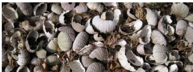
Sea urchin shells are usually regarded as waste

Shakotan, a small fishing town in western Hokkaido, was faced with a problem which sea urchin harvesters all over the world will be familiar with: roes becoming smaller and more inferior in quality as the urchins over-forage on depleting kelp forests. At the same time, the industry in Shakotan had to find a way to dispose of urchin shells left behind after roe harvesting. The town developed an environmentally sustainable and unique solution to these problems. Urchin shells were used to make an underwater fertilizer which successfully regenerated kelp growth; sea urchins returned to feed on the kelp, and the roe production increased by 48% with improved quality.