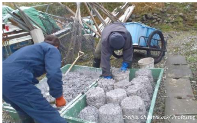
The mixture is placed in containers such as buckets, then naturally dried.